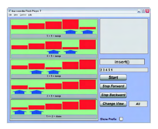
Fig. 3. Visualization of the insert of Insertion Sort.

Visualization. Associated visual representation may be used by the learner to help him or her understand the basic properties of this abstraction, such as invariants. It is possible to embed any web-viewable animations built by AA systems, such as Ganimal (Ganimal, 2007; Diehl et al., 2002; Diehl and Kerren, 2002), Animal (Roßling and Freisleben, 2002), or JSamba (JSamba, 2007), as well as other formats, for example Marcomedia Flash (Macromedia, 2007) visualizations, animated GIFs, sound files, etc. As an example, Figure 3 shows a Flash visualization of the insert() function of the Insertion Sort algorithm. Additional hyperlinks provide a description of fundamental concepts and an intuitive analogy, similar to HalVis.