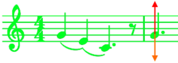
Figure 3: Arpeggio for fields on the left (negative x -angles). The melody moves downwards. The tempo is a function of the x -angle. The pitch of the last note is a function of the y -angle.

The y -angle manipulates the pitch continuously, so you may hear changes while the note is being played. Such a strategy has been referred to as scalable earcon [6].