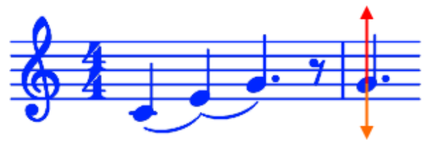
Figure 2: Arpeggio for fields on the right (positive x -angles). The melody moves upwards. The tempo is a function of the x -angle. The pitch of the last note is a function of the y -angle.

When y is 0, the fifth is played once more. For positive y -values, the pitch goes up (red arrow). For negative values, it goes down (orange arrow). You only need to compare the last two notes to understand whether you have to tilt the phone towards or away from you.